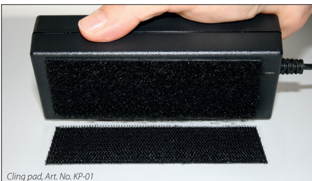
Cling pad, Art. No. KP-01