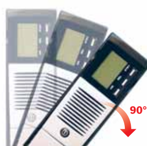
3. Rotate the UPS 90°