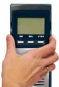
1. Remove the mimic panel