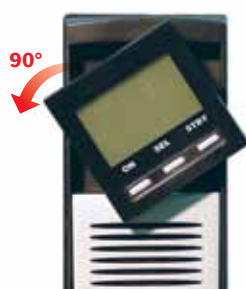
2. Rotate the mimic panel and insert it into position